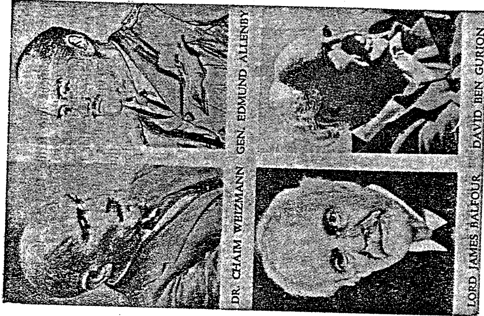
DR. CHAIM WEIZMANN

Wherever the returning exiles are settling, they are, under Divine blessing, through scientific agriculture and fruit culture restoring the former fertility of the land. In 1927 the Pools of Solomon, dry for centuries, began to overflow and some 60,000,000 gallons of water were by measurements estimated to be in the pools. At that time the High Commissioner of Palestine was asked to declare a day of public thanksgiving for this seeming miracle. For many centuries the "early rains" had disappeared entirely. But, these have returned to gladden the land, with the result that some parts of Palestine yield two or three crops a year. By irrigation, drainage etc. hundreds of thousands of acres have been transformed from swampy, arid and